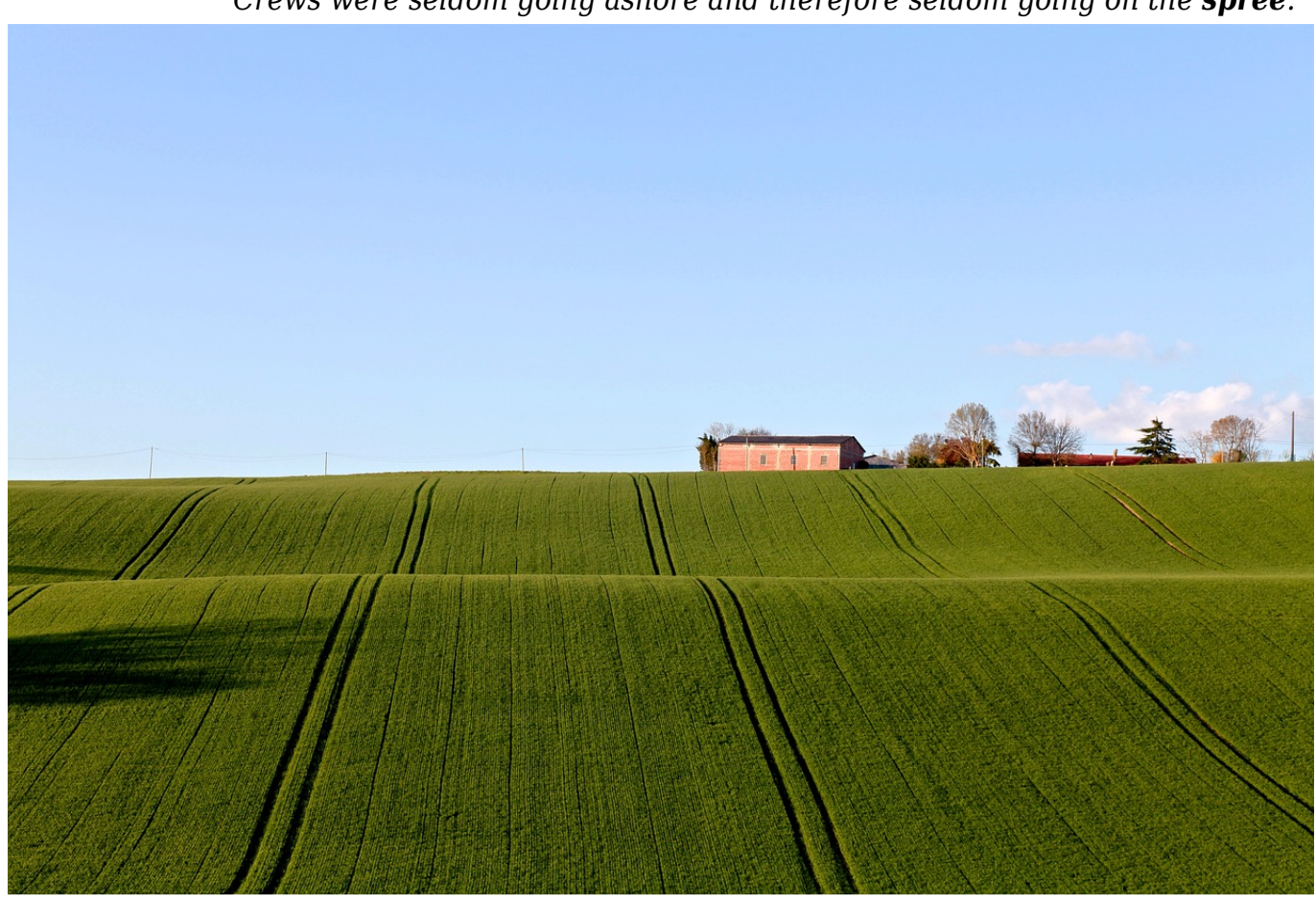
Usage Examples of "Revel" as a noun

spree Crews were seldom going ashore and therefore seldom going on the spree .