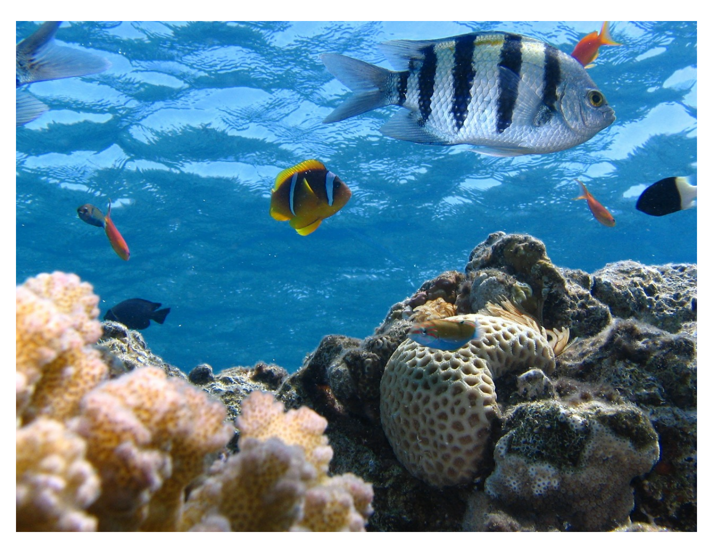
Synonyms of "Riff" as a noun (1 Word)

riffian A Berber living in northern Morocco.