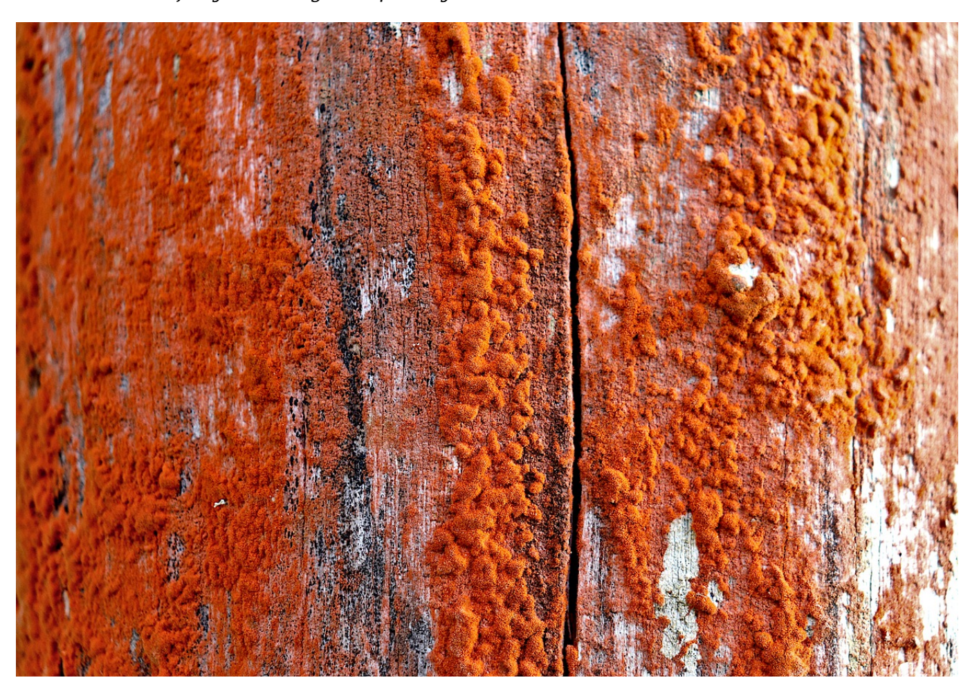
Rotten as an Adverb