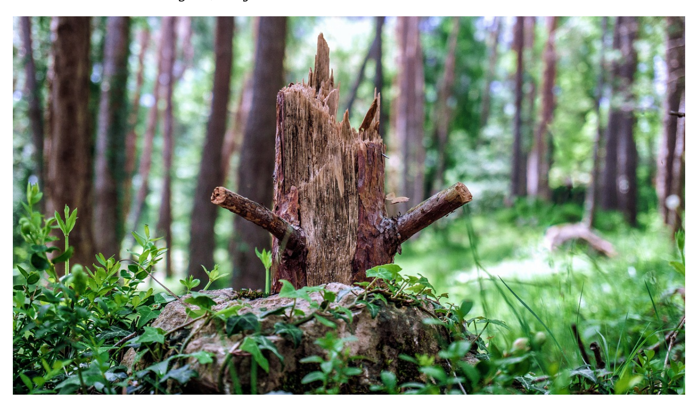
Synonyms of "Rotten" as an adverb (1 Word)