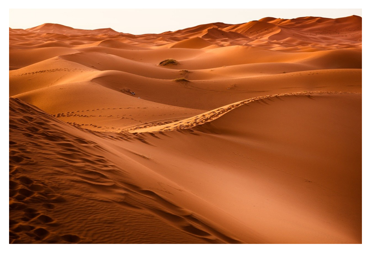
Synonyms of "Sand" as a verb (1 Word)

\mathbf{sandpaper} \ \frac{\mathbf{Smooth \ with \ sandpaper}}{\mathbf{Sandpaper} \ the \ wooden \ surface}.