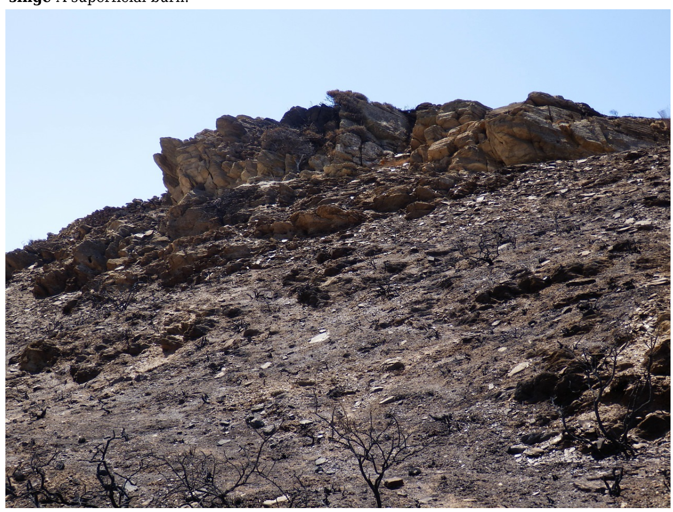
Usage Examples of "Scorch" as a noun