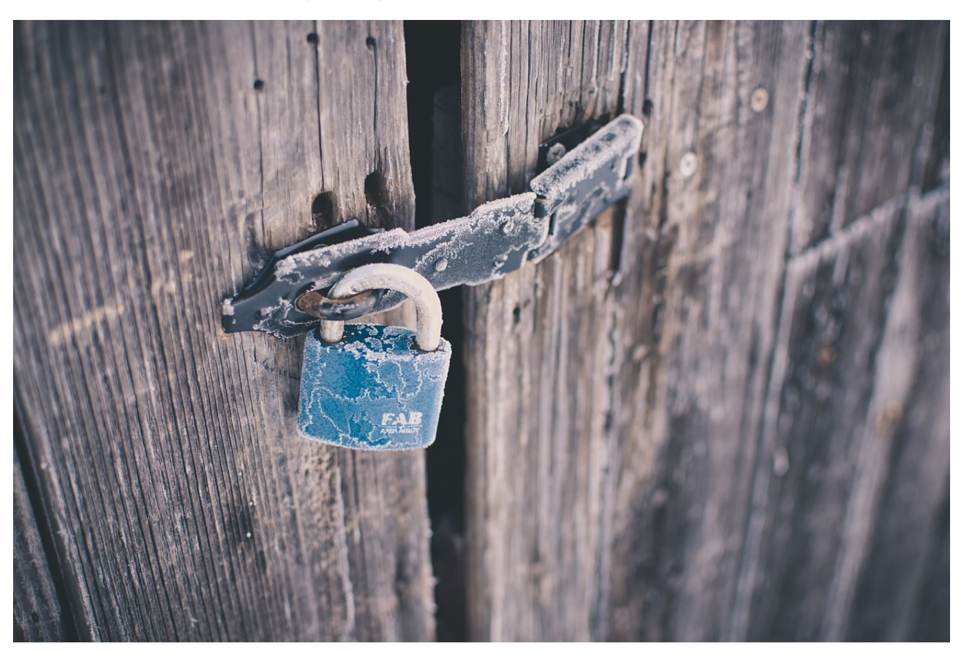
Synonyms of "Secure" as a verb (62 Words)