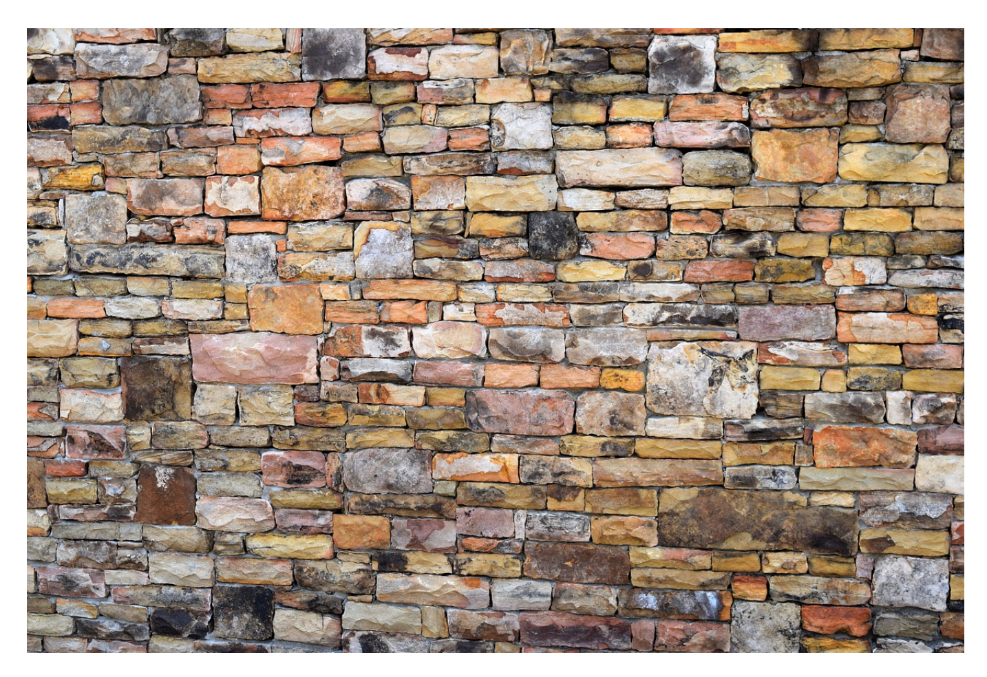
Usage Examples of "Solid" as a noun

• She drinks only milk and rarely eats solids.