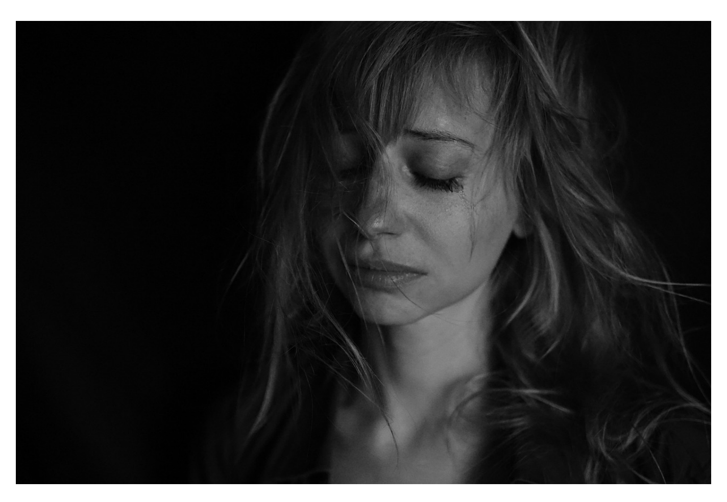
Usage Examples of "Sorrow" as a verb

• A woman had cried all night, sorrowing over the death of her husband.