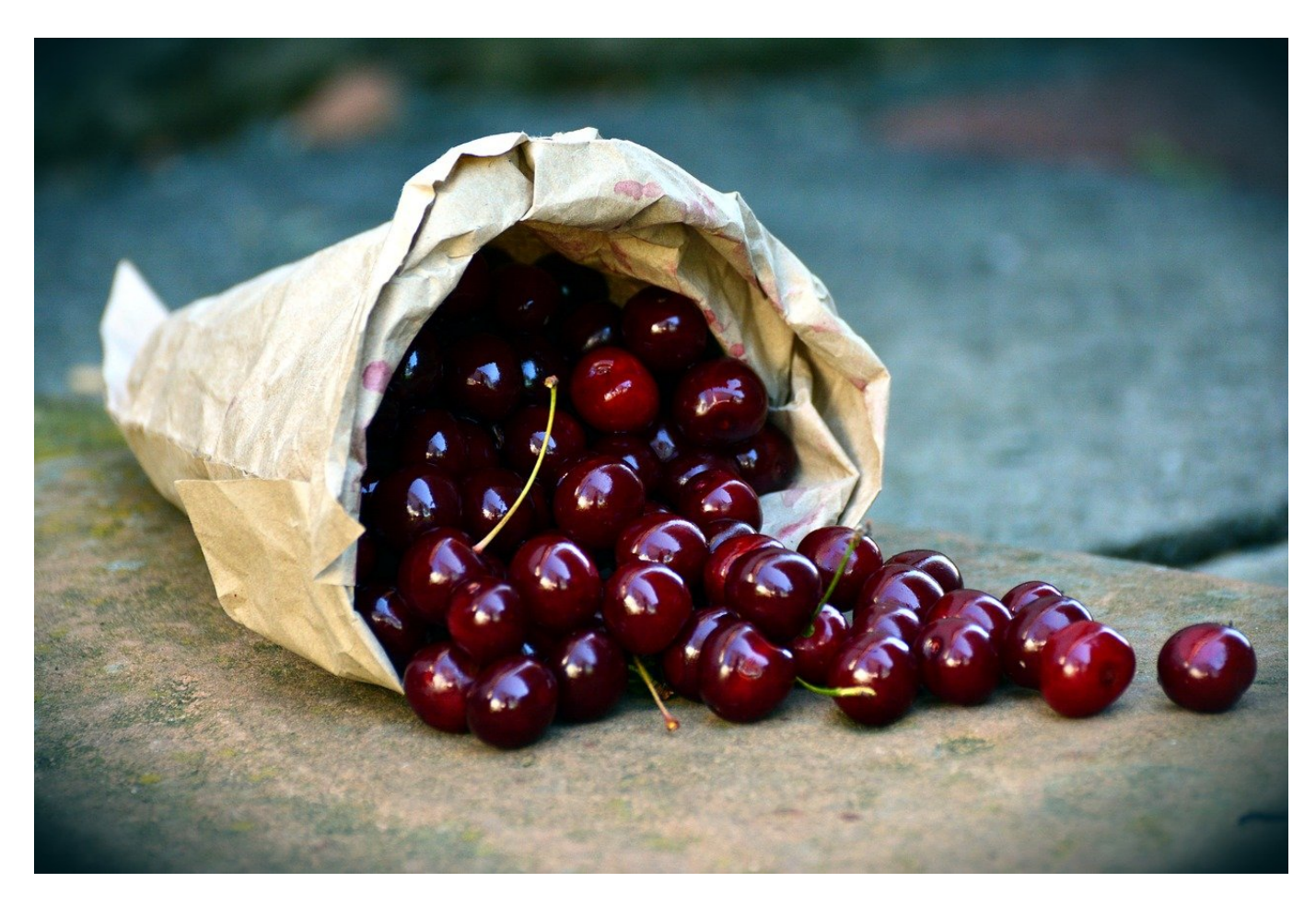
Usage Examples of "Sour" as a noun