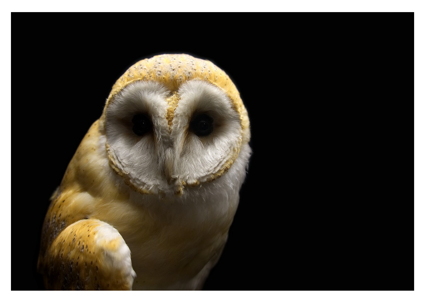
Usage Examples of "Stealthy" as an adjective