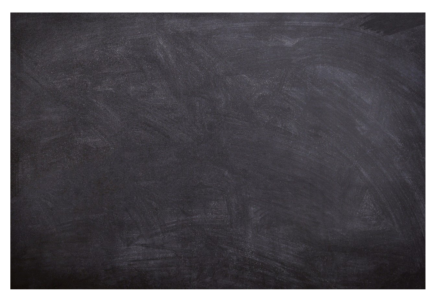
Usage Examples of "Structured" as an adjective