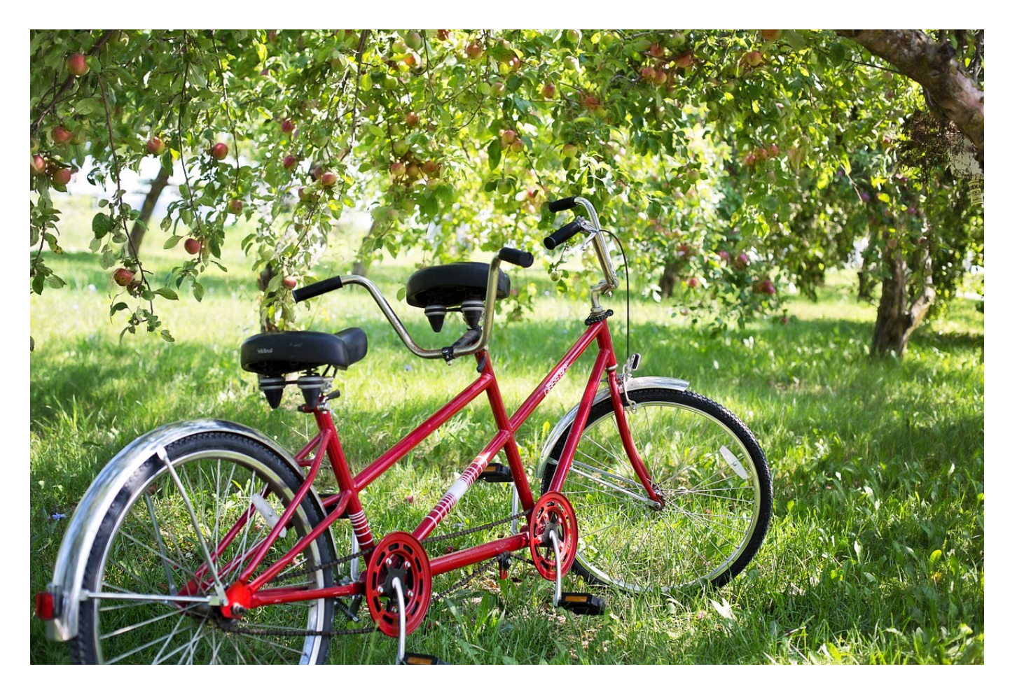
Synonyms of "Tandem" as an adverb (1 Word)