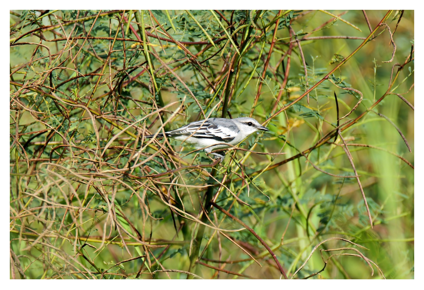
Synonyms of "Timid" as a noun (1 Word)

<u>cautious</u> People who are fearful and cautious.