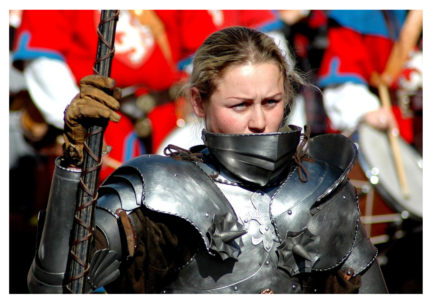
Usage Examples of "Tournament" as a noun