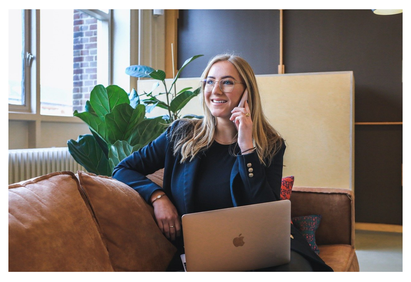
Usage Examples of "Trainee" as a noun