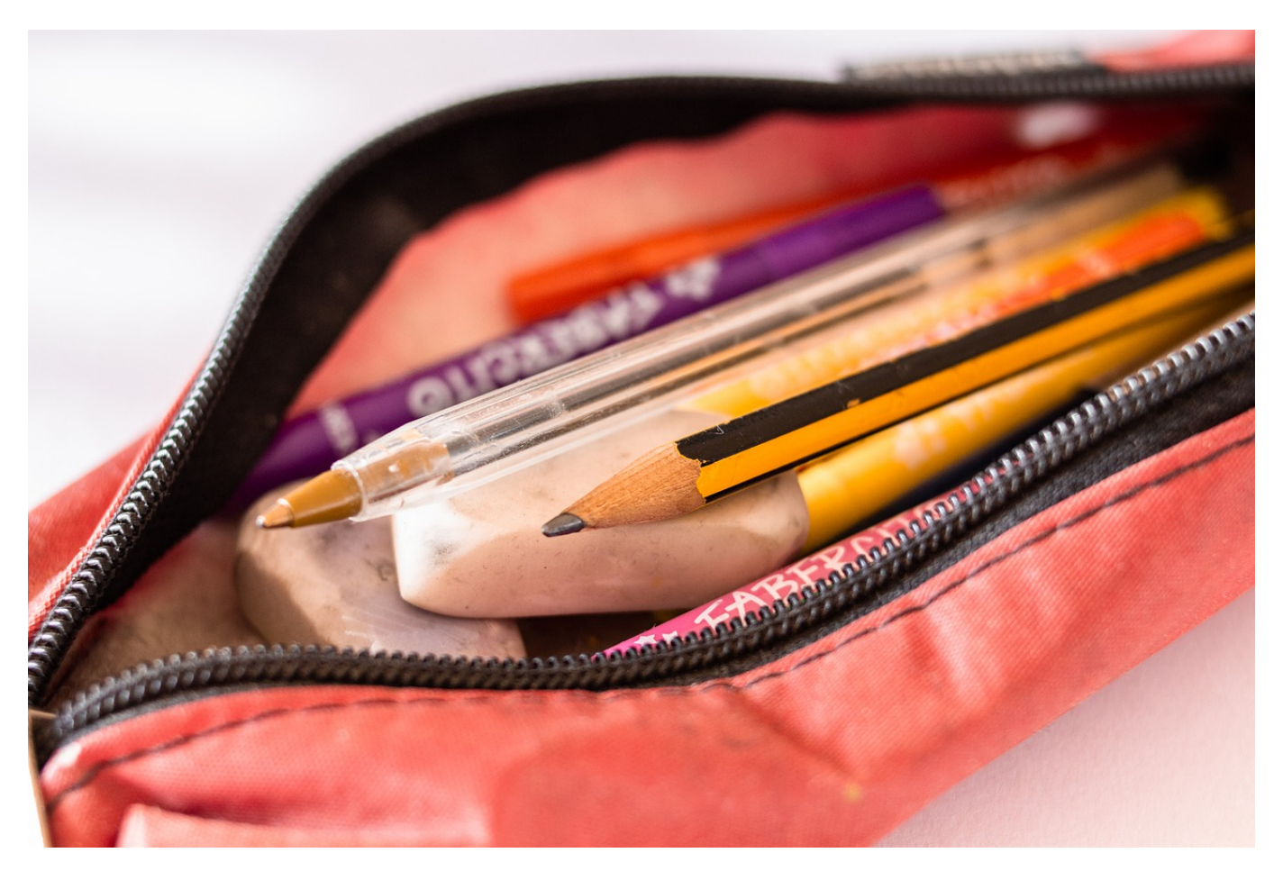
Synonyms of "Underline" as a noun (1 Word)

underscore A line drawn underneath (especially under written matter.