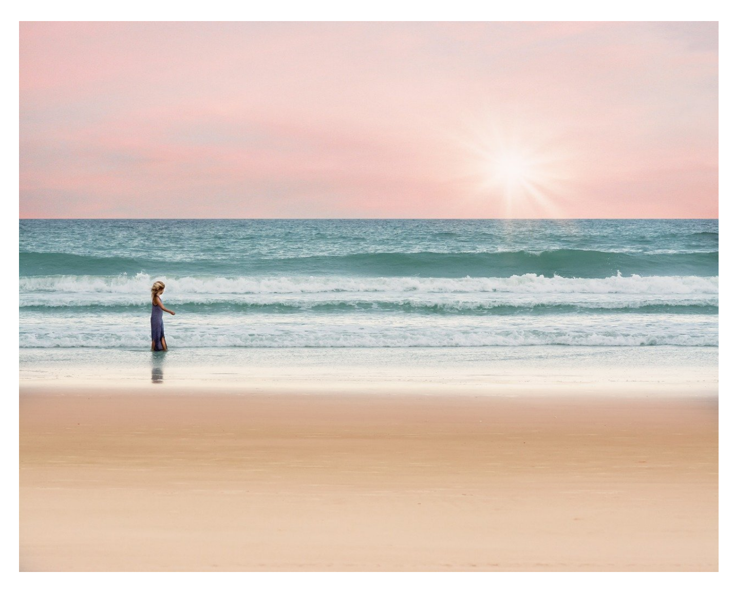
Usage Examples of "Vacation" as a verb

• I was vacationing in Europe with my family.