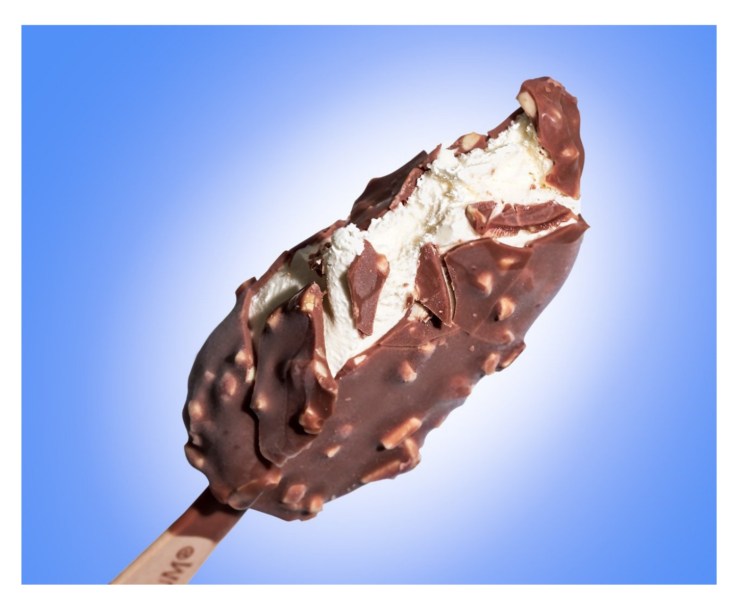
Synonyms of "Vanilla" as a noun (1 Word)

vanillaextractAny of numerous climbing plants of the genus Vanilla having fleshy leavesand clusters of large waxy highly fragrant white or green or topaz flowers.