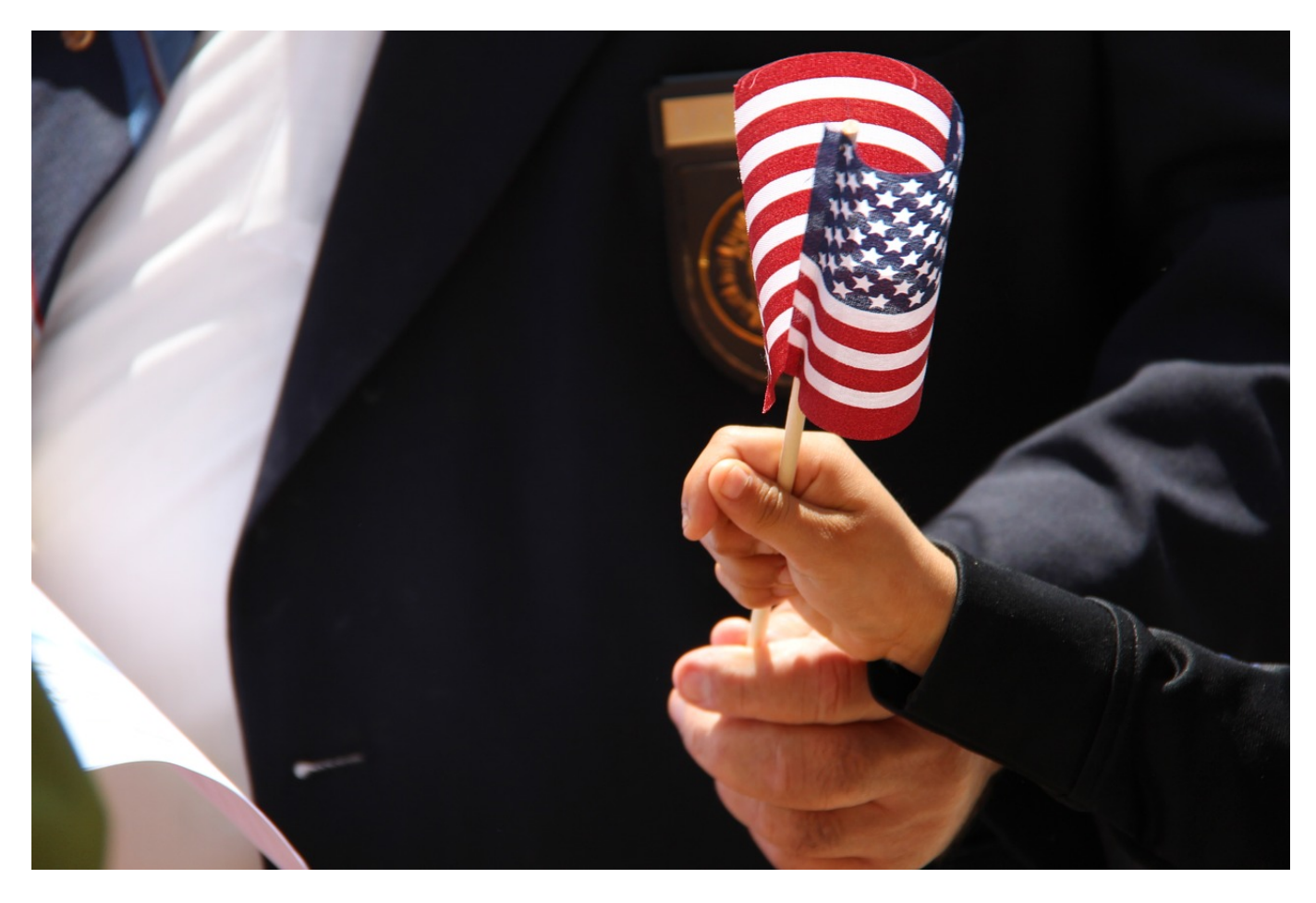
Synonyms of "Veteran" as an adjective (1 Word)

seasoned Aged or processed. Seasoned flour.