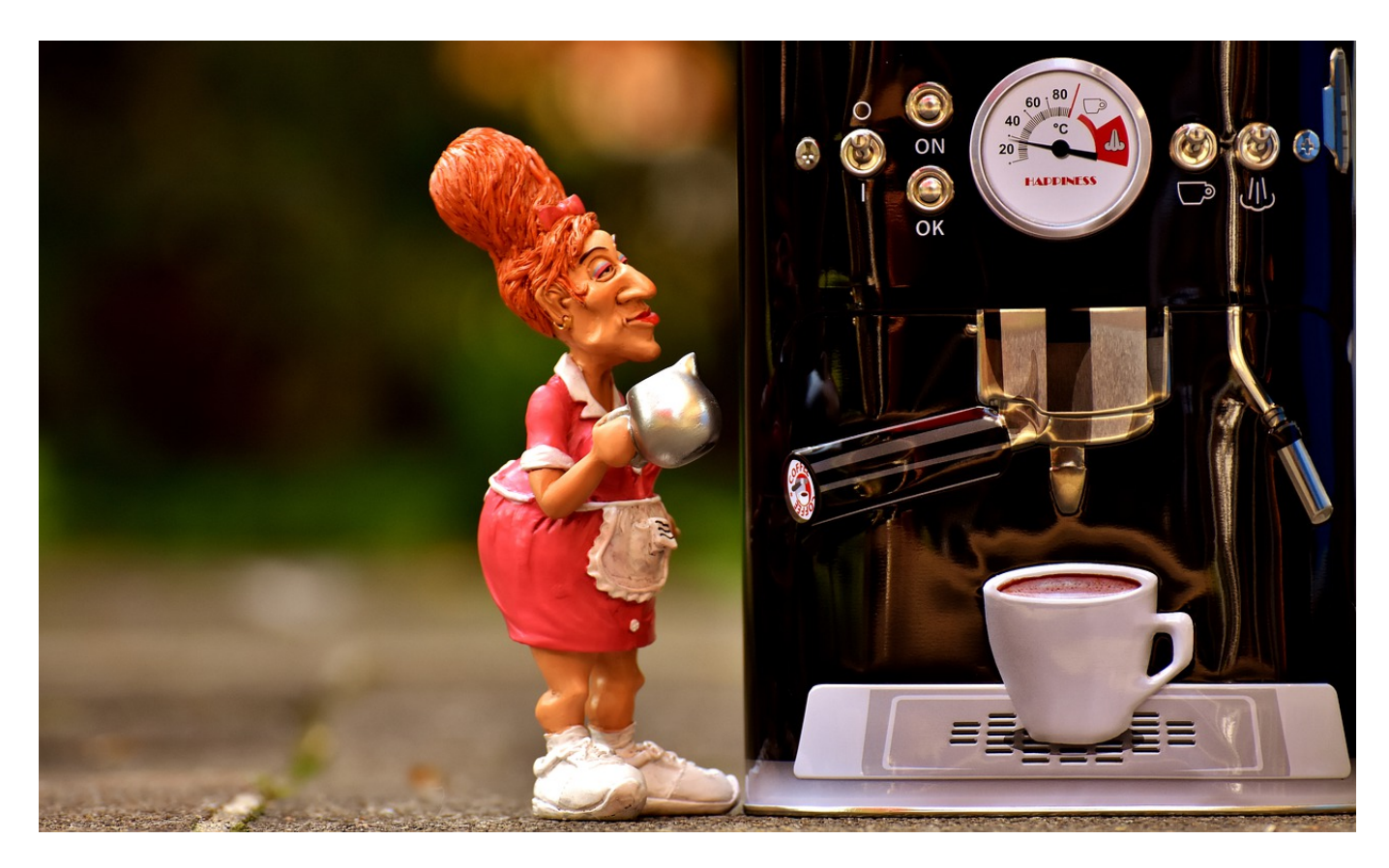
Synonyms of "Waitress" as a verb (1 Word)