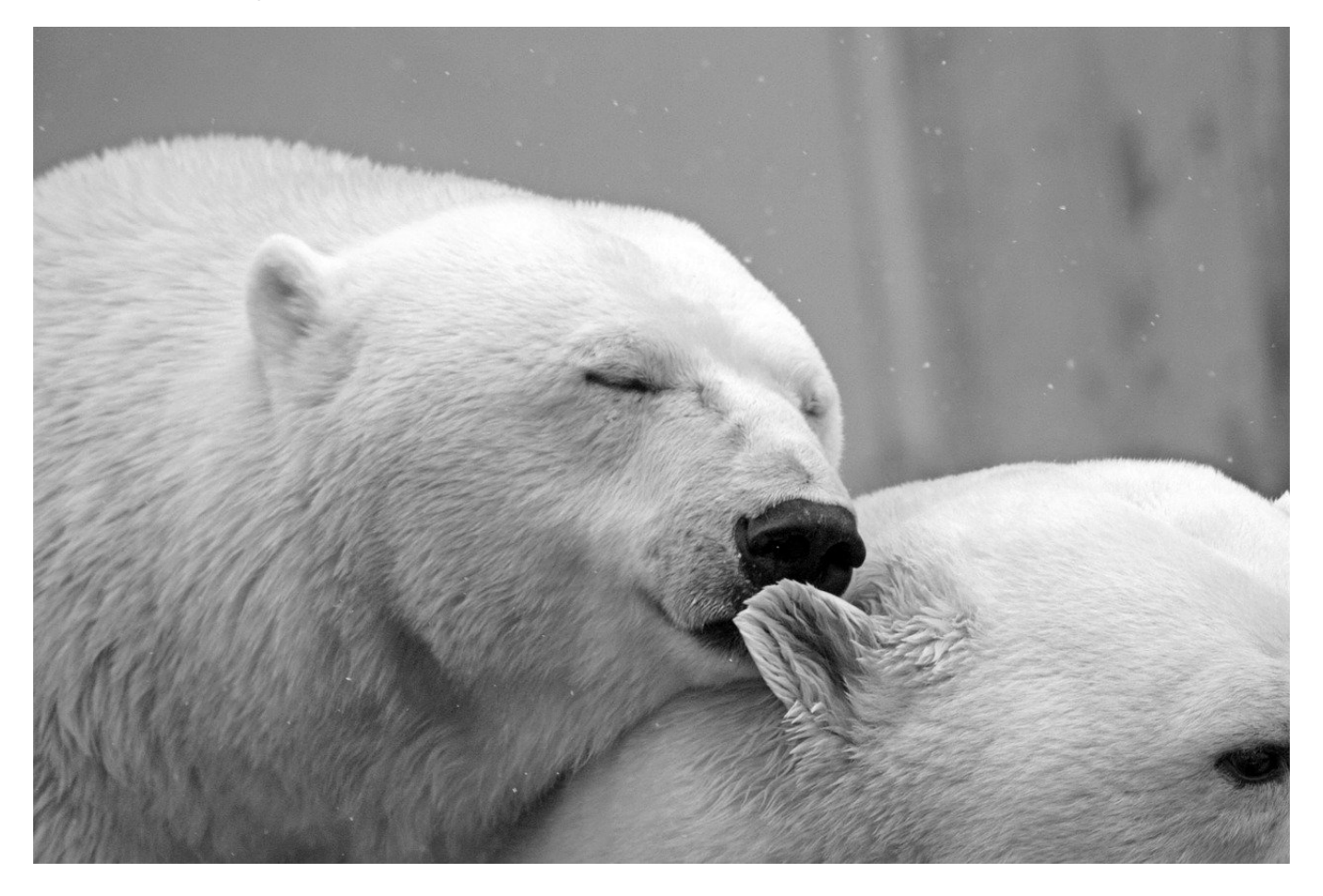
Synonyms of "Whisper" as a verb (11 Words)