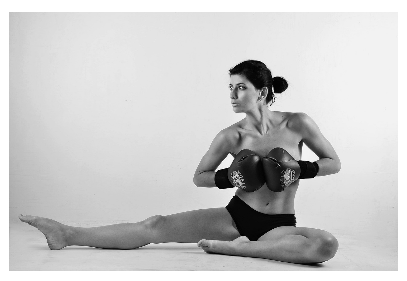
Usage Examples of "Wrestling" as a noun

• We watched his grappling and wrestling with the bully.